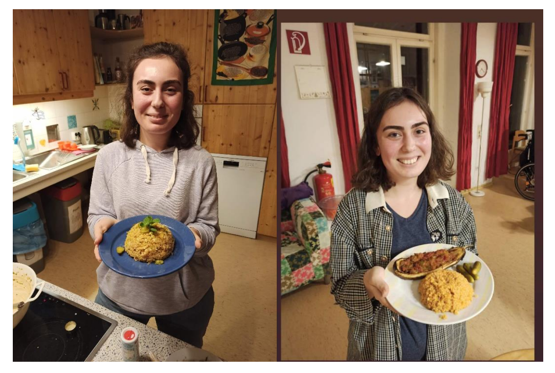
This dish is called Kısır.

When I realized that it will not work, I started to work as a zivildienst. We were cooking everyday, going for a shopping, seting up the dinner table then cleaning everything. It was fun for me. Sometimes I cooked Turkish dishes too. I will add some photo about it.